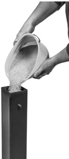
Figure 4 - Add balast to column.