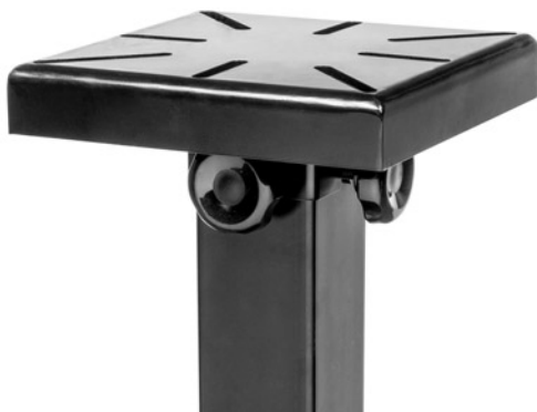
Figure 5 - Secure table to column.