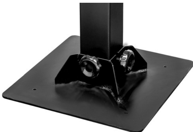
Figure 3 - Secure column to base.