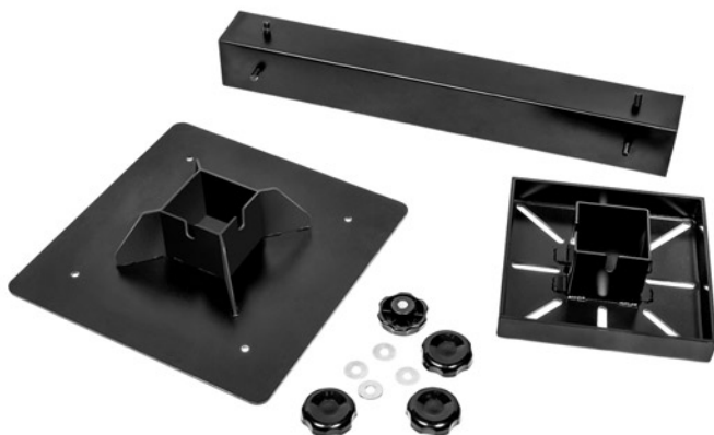
Figure 2 - Unpack parts.